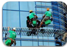
Operations And Maintenance